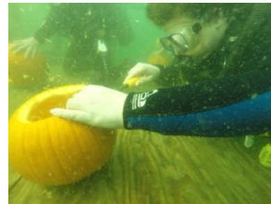
Divers' busy carving pumpkin

The water temperatures should be in the 60 degree range, with the best water visibility of the season! The pumpkins will spilled their guts out on shore prior to the dive, and then add some Scout-rendered under water "vegetable surgery". Last year it took a mere 32 minutes of underwater precision carving to turn ordinary garden gourds in to underwater masterpieces!